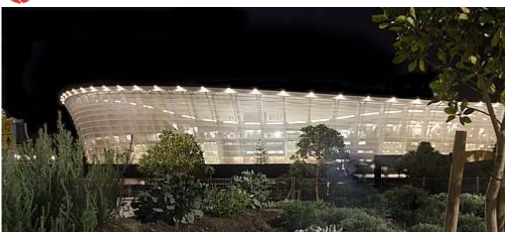
The Calm Before The Storm ~ Green Point Stadium just before kick-off

Ke Nako ~ Ayoba ~ Vuvuzela ~ Diski Dance ~ Jabulani ~ Makarapa Some new words the world learned from us this week