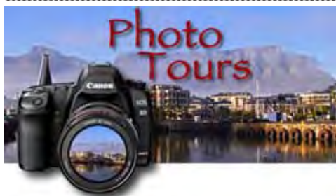
Photo Tours, based in Cape Town, South Africa offer specialised photographic tours around the city and Cape Peninsula.

They will take you to those special places for that perfect shot. We'll also sharpen your photographic skills and tune your technique to